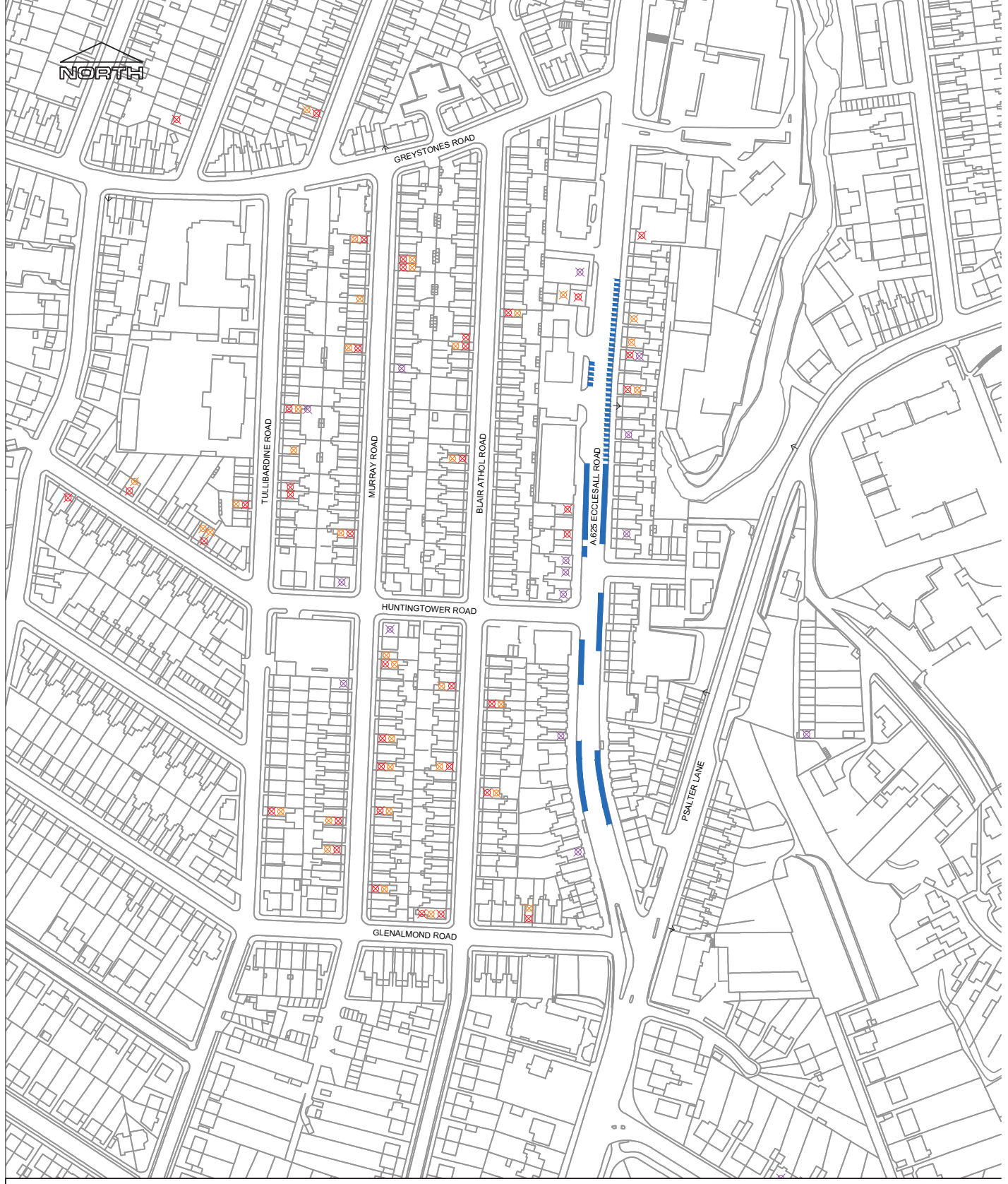
APPENDIX A - Plot of locations of signatories of petitions received Apr - Jun '14